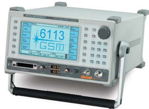
6113 Digital Radio Test Set

Test Sequence mode allows the user to run a complete sequence of single tests using only one or two keystrokes, allowing controlled and repeatable testing.