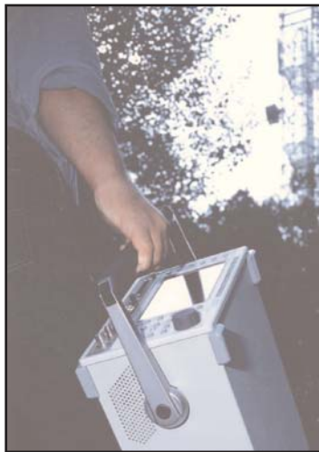
6113 Digital Radio Test Set can be easily carried to remote sites

The PC memory cards and hard disks provide the user with the ability to store and recall a number of instrument set-ups, test sequences and configuration files for carrying out various tests on differing BTS types. New test sequences can be generated from the front panel using a special learning facility and then stored on the memory card. In this way tests can be selected, limits and parameters changed, and printing controlled, guaranteeing total control and repeatability of testing.